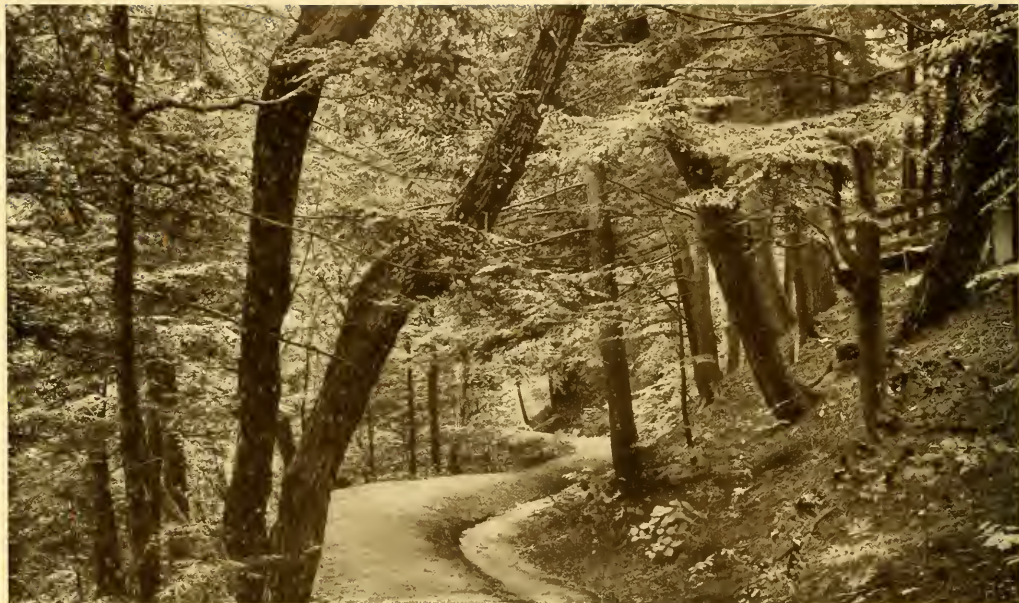
GOLDWIN SMITH WALK